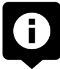
Points of interest