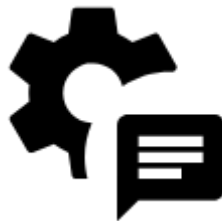
Language & Units